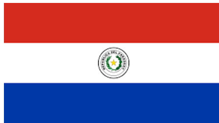
Paraguay (NB: two sided flag!)